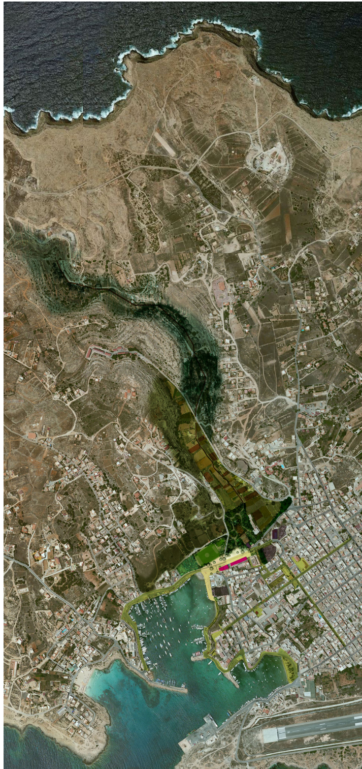
Figure 3 - The Strategic Project of "The Green Valley" (Cycle 2016)

At the core of the model lay a double concern with practice; the construction of a set of realistic propositions; and a cooperative (not competitive) model of learning and exchanging views around the design process.