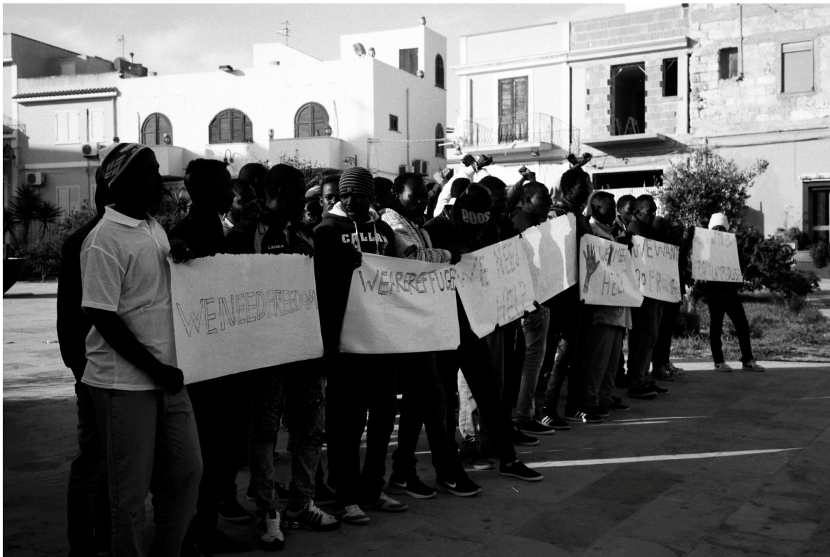
Figure 2 - Migrants' Protest in Lampedusa

those elements, which could nourish a development strategy, the main concerns of which were tourism, refugees, and the rehabilitation of the built environment.