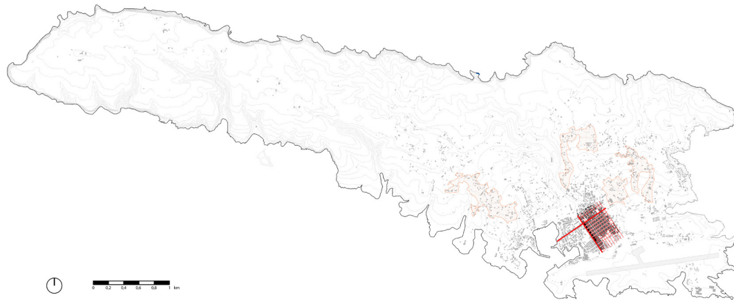
Figure 4 - The Structure of the Built Environment (Cycle, 2016)

The first step of investigation is influenced by a pragmatic approach (Servillo and Schreurs, 2013). The participants prepared some preliminary notes on thematic groups before the trip to Lampedusa, mixing expert data (from statistics and maps) and ordinary information (from newspaper and novels). All sources, however, were derived from an accurate selection of literature and technical documents. This exercise had previously been the object of a few analytical and methodological courses in the first semester (Figure 4).